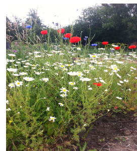
Timebank allotment - wild flower garden